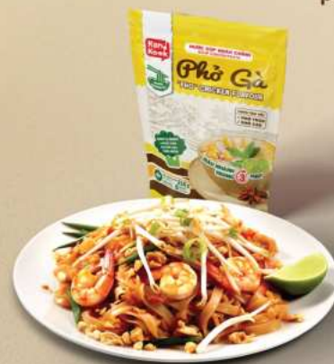
Stir-fried Seafood Pho Noodles with Pho Chicken Flavour Soup Concentrate KanKook

Catering to the creative individuals, the product also encourages innovation of new delicious flavour combinations tailored to their preferences.