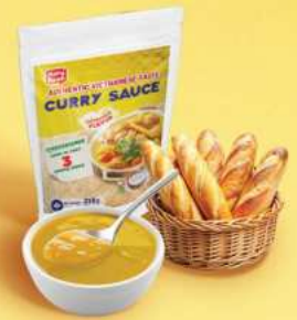
Bread served with Curry Sauce for dipping.