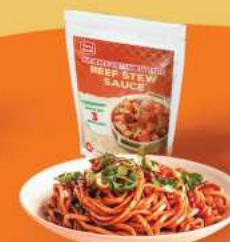
Spaghetti with Vietnamese Beef Stew Sauce KanKook