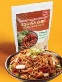
Spaghetti with Char Siu Sauce and Sausages

This product can be utilized as a ready-to-eat dressing without cooking required.