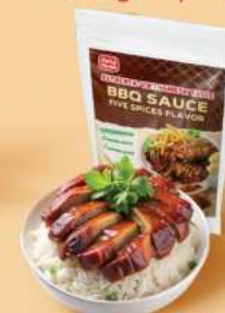
Broken Rice with BBQ Grilled Pork (Vietnamese Style)