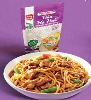
Beef Stir-fried Noodles with "Bun Bo Hue" Spicy Beef Soup Concentrate

Catering to the creative individuals, the product also encourages innovation of new delicious flavour combinations tailored to their preferences.