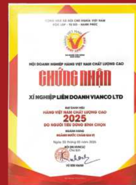
High Quality Vietnamese Product.