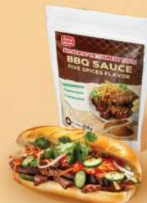
BBQ Grilled Pork Bread (Vietnamese Banh Mi Style)

This product can be utilized as a ready-to-eat dressing without cooking required.