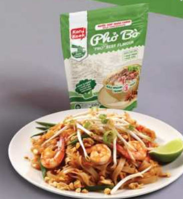
Stir-fried Seafood Pho Noodles with Pho Beef Flavour Soup Concentrate KanKook

Catering to the creative individuals, the product also encourages innovation of new delicious flavour combinations tailored to their preferences.