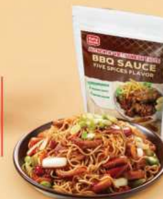
Grilled Sausage Spaghetti with BBQ Sauce