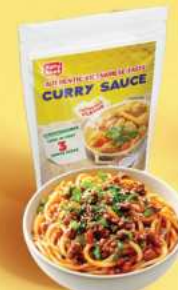
Spaghetti with Curried Minced Meat