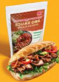
Char Siu Grilled Pork Bread (Vietnamese Banh Mi Style)