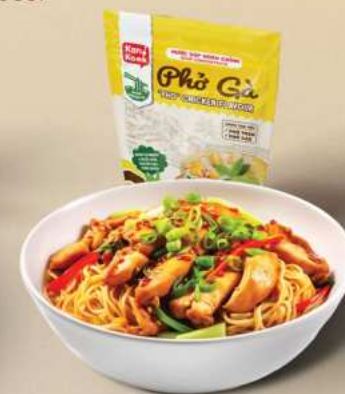
Chicken Noodles in Pho Chicken Flavour Soup Concentrate KanKook