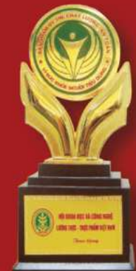
Prestigious And Quality Products For Consumers' health