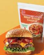
Beef Burger with Vietnamese Beef Stew Sauce KanKook

This product can be utilized as a ready-to-eat dressing without cooking required.