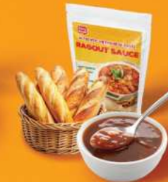
Bread with Ragout Sauce for Dipping