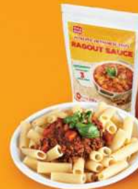
Macaroni with Minced Meat Ragout

This product can be utilized as a ready-to-eat dressing without cooking required.