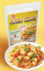
Stir-fried Noodles with Chicken Curry

This product can be utilized as a ready-to-eat dressing without cooking required.