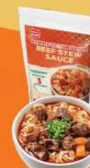
Spicy Beef Stew Noodle (Vietnamese Style)