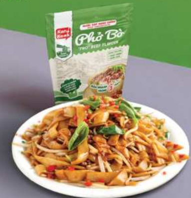
Mixed Noodles with Pho Beef Soup Concentrate KanKook