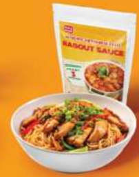
Chicken Ragout Noodles