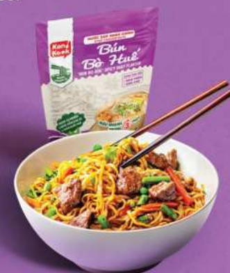
Beef Mixed Noodles with "Bun Bo Hue" Spicy Beef Soup Concentrate