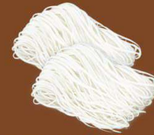
DRIED RICE NOODLE 100 g