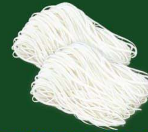
DRIED RICE NOODLE 100 g