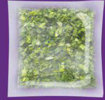
DRIED SPRING ONION 1 g