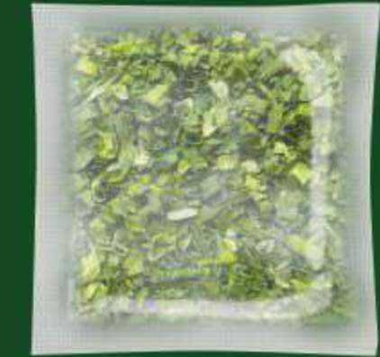
DRIED SPRING ONION 1 g