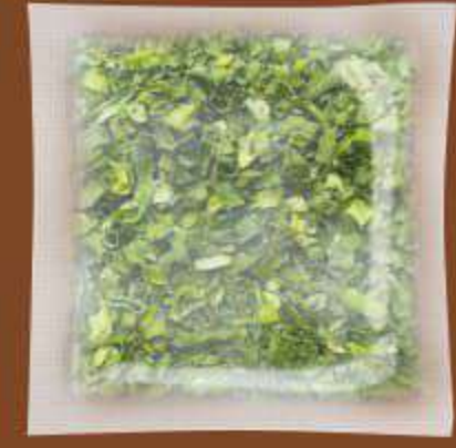
DRIED SPRING ONION 1 g