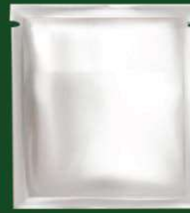
SOUP CONCENTRATE BAG 84 g