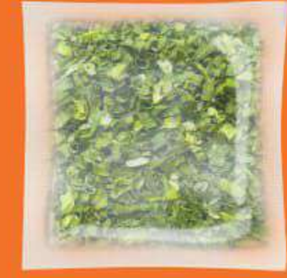
DRIED SPRING ONION 1 g