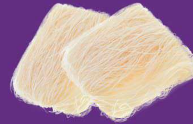
DRIED RICE NOODLE 100 g