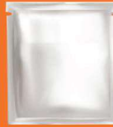
SOUP CONCENTRATE BAG 84 g