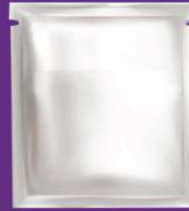
SOUP CONCENTRATE BAG 84 g