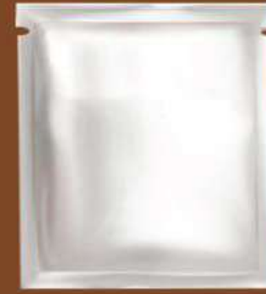
SOUP CONCENTRATE BAG 84 g