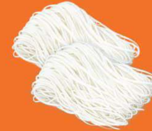
DRIED RICE NOODLE 100 g