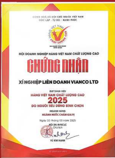
High Quality Vietnamese Product.