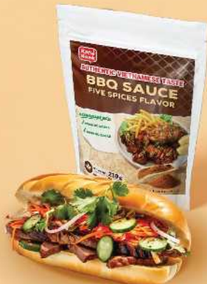
BBQ Grilled Pork Bread (Vietnamese Banh Mi Style)

This product can be utilized as a ready-to-eat dressing without cooking required.