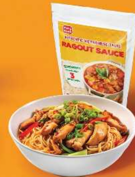
Chicken Ragout Noodles