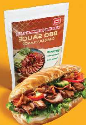
Char Siu Grilled Pork Bread (Vietnamese Banh Mi Style)