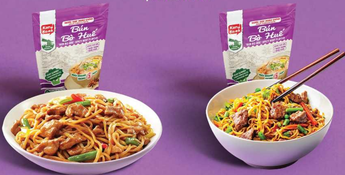
Beef Stir-fried Noodles with "Bun Bo Hue" Spicy Beef Soup Concentrate

Catering to the creative individuals, the product also encourages innovation of new delicious flavour combinations tailored to their preferences.