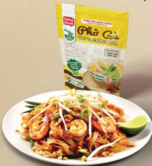
Stir-fried Seafood Pho Noodles with Pho Chicken Flavour Soup Concentrate KanKook

Catering to the creative individuals, the product also encourages innovation of new delicious flavour combinations tailored to their preferences.