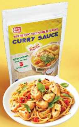
Stir-fried Noodles with Chicken Curry

This product can be utilized as a ready-to-eat dressing without cooking required.