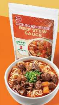
Spicy Beef Stew Noodle (Vietnamese Style)