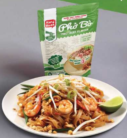
Stir-fried Seafood Pho Noodles with Pho Beef Flavour Soup Concentrate KanKook

Catering to the creative individuals, the product also encourages innovation of new delicious flavour combinations tailored to their preferences.