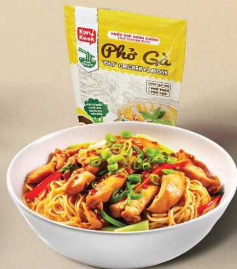
Chicken Noodles in Pho Chicken Flavour Soup Concentrate KanKook