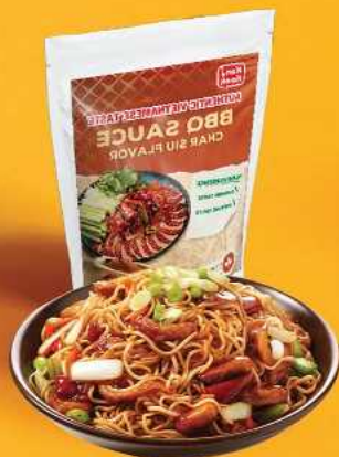
Spaghetti with Char Siu Sauce and Sausages

This product can be utilized as a ready-to-eat dressing without cooking required.