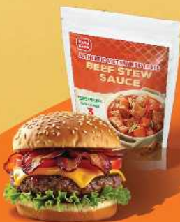
Beef Burger with Vietnamese Beef Stew Sauce KanKook

This product can be utilized as a ready-to-eat dressing without cooking required.