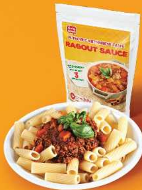
Macaroni with Minced Meat Ragout

This product can be utilized as a ready-to-eat dressing without cooking required.