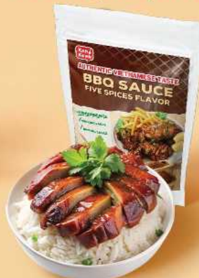
Broken Rice with BBQ Grilled Pork (Vietnamese Style)