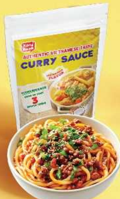
Spaghetti with Curried Minced Meat