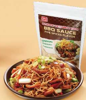
Grilled Sausage Spaghetti with BBQ Sauce