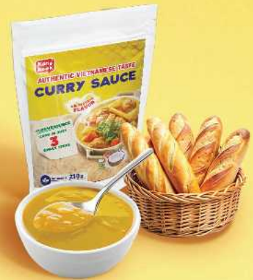
Bread served with Curry Sauce for dipping.