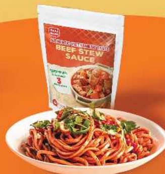
Spaghetti with Vietnamese Beef Stew Sauce KanKook