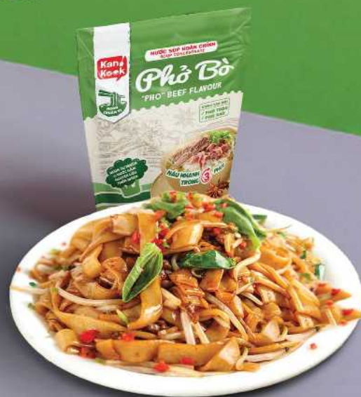
Mixed Noodles with Pho Beef Soup Concentrate KanKook