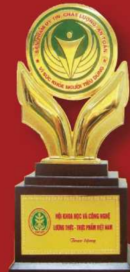
Prestigious And Quality Products For Consumers' health