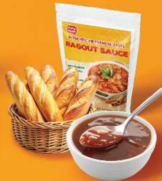
Bread with Ragout Sauce for Dipping